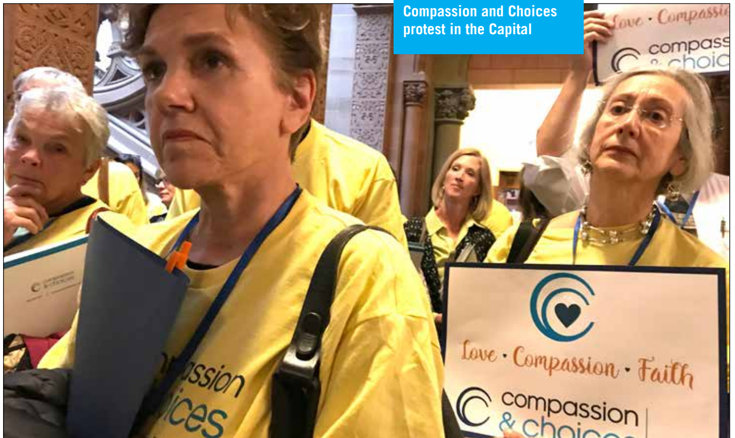
Compassion and Choices protest in the Capital

Then read, or at least skim, all the background materials found on the LWVNY website: http://www.lwvny.org/programs-studies.html